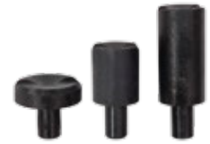
3 piece adapter kit included as standard accessory