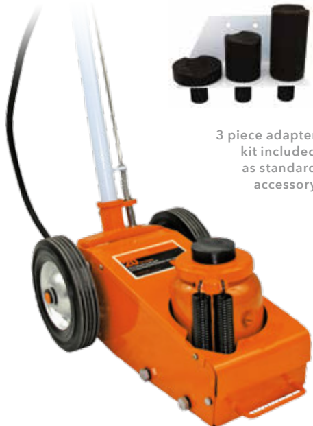
3 piece adapter kit included as standard accessory