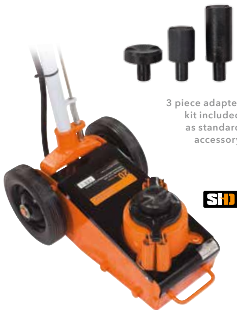
3 piece adapter kit included as standard accessory