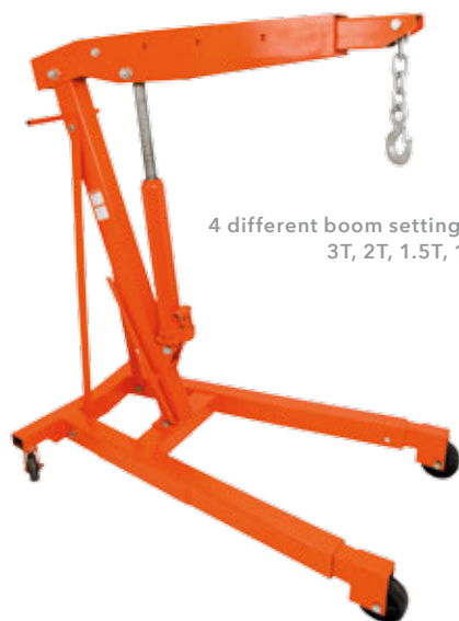
4 different boom settings: 3T, 2T, 1.5T, 1T